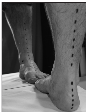
Fig. 1: NCSP using NAS Anterior Lines Method.

place into NCSP with the anterior line markings which reflect (in the mirror), observe the rearfoot position. Note that the anterior line is aligned with the 2nd metatarsal head