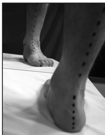
Fig. 1: RCSP using NAS Anterior Lines Method.

In figure 2 the patient (same foot & markings as in figure 1) was allowed to stand normally (i.e. their Resting Calcaneal Stance Position or RCSP) and the rearfoot and anterior view compared. Note that the anterior line leans towards the the 1st metatarsal